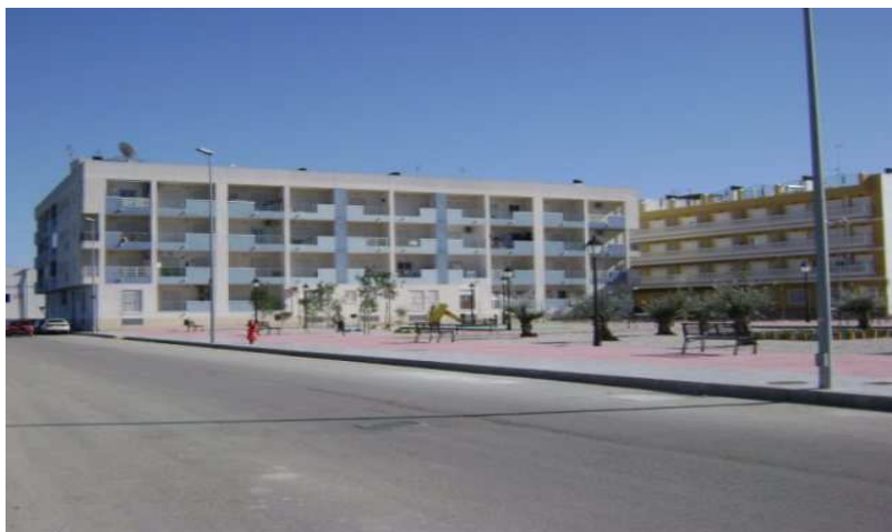
Ref: Almoradi A551

For Sale or To Rent: For Sale Guide Price Quick Sale: Offers around 95,000€ Location: Almoradi - Village of Almoradi Type: Ground floor Apartment Living Areas: 103m2 Beds: 3 Baths: 2 Other Factors: Includes a secure private parking space